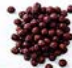
Out of Packaging