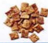
Out of Packaging